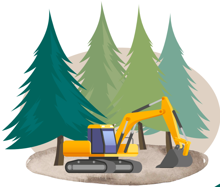
The frightening threat of newcomers